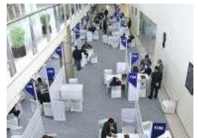
Direct B2G meetings with procurement officers