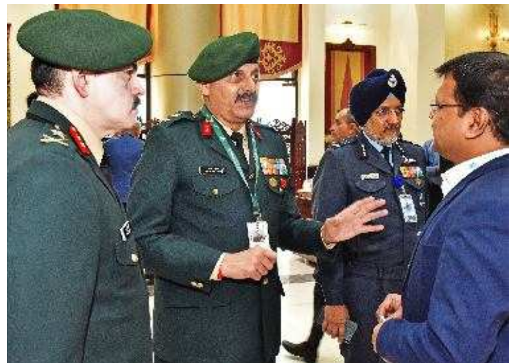
Senior subject matter experts explain Services' requirements